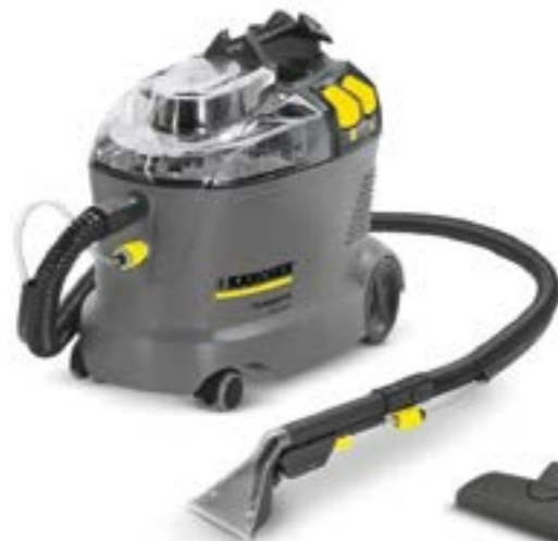
Puzzi 8/1 C Upholstery Cleaner Professional Use