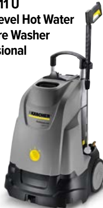
HDS 5/11 U Entry Level Hot Water Pressure Washer Professional Use