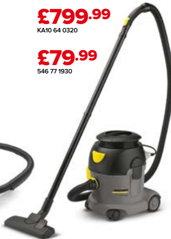
T 10/1 Adv Tub Professional Vacuum Cleaner