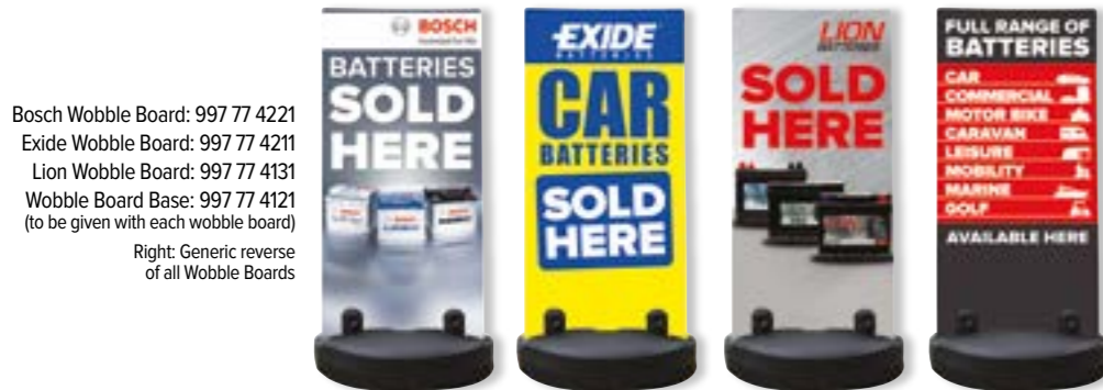
Bosch Wobble Board: 997 77 4221 Exide Wobble Board: 997 77 4211 Lion Wobble Board: 997 77 4131 Wobble Board Base: 997 77 4121 (to be given with each wobble board) Right: Generic reverse of all Wobble Boards