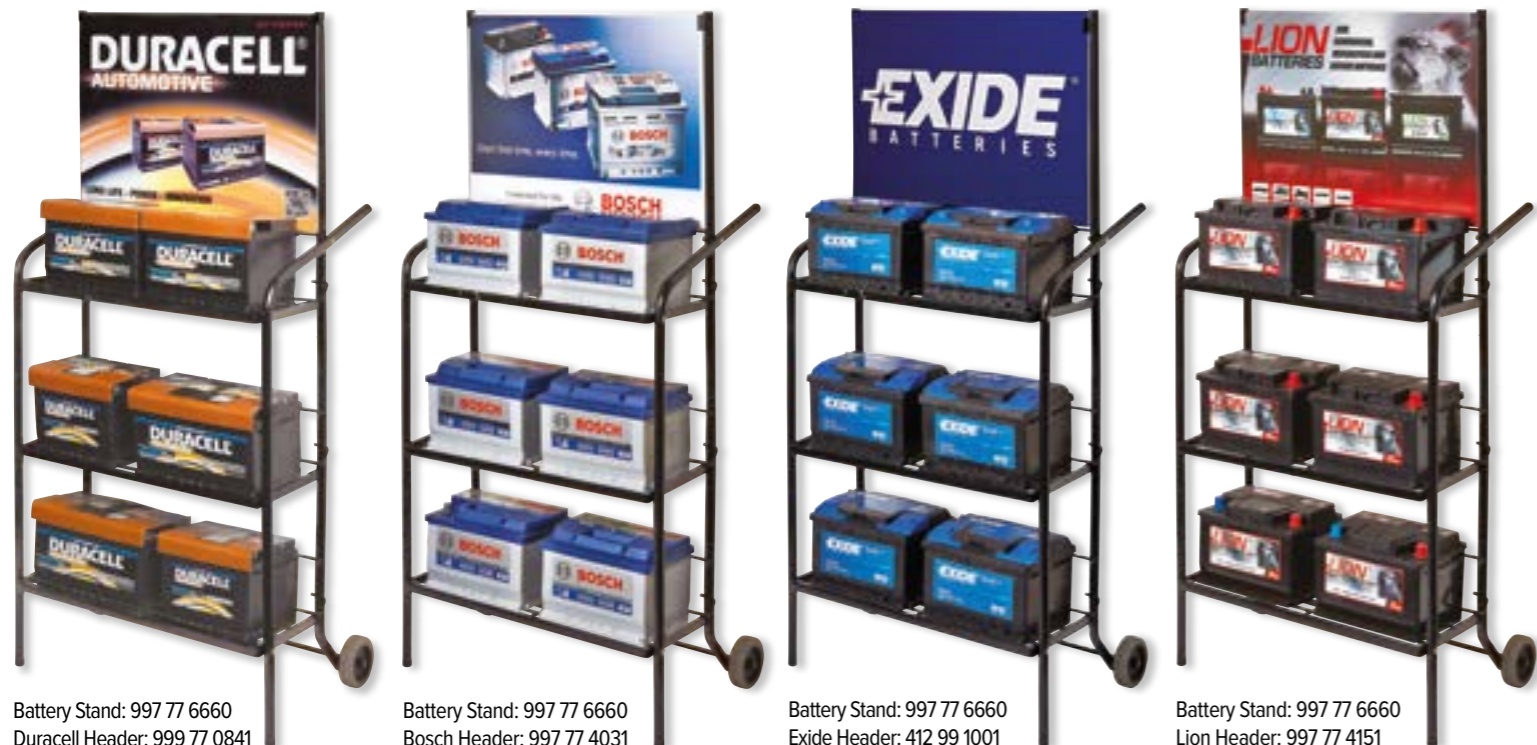
Battery Stand: 997 77 6660 Duracell Header: 999 77 0841

BUY ANY 10 BATTERIES GET A FREE BATTERY STAND WITH HEADER BOARD OR BATTERY WOBBLE BOARD