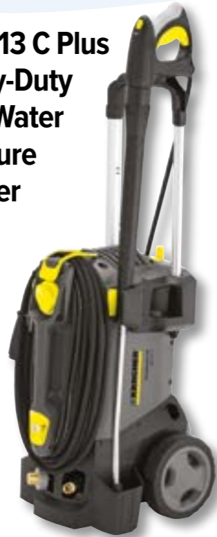
HD 6/13 C Plus Heavy-Duty Cold Water Pressure Washer