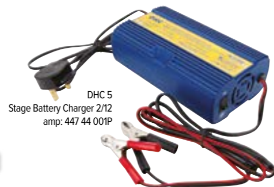
DHC 5 Stage Battery Charger 2/12 amp: 447 44 001P

BUY ANY 15 BATTERIES GET A FREE DHC INTELLIGENT BATTERY CHARGER AND STAND OR WOBBLE BOARD*