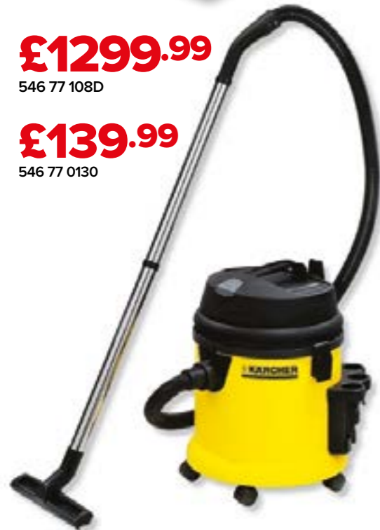
NT 27/1 Pro All Purpose Commercial Wet & Dry Vacuum Cleaner