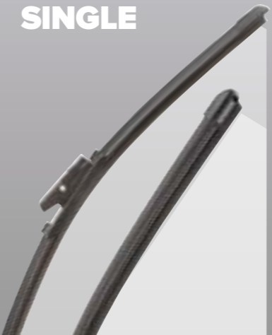
BOSCH AEROTWIN PLUS FLAT WIPER BLADE SINGLE